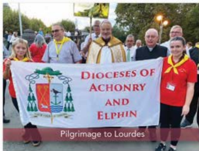
Pilgrimage to Lourdes