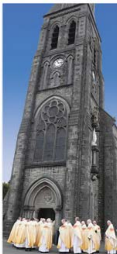
Priests outside Ballaghaderreen Cathedral prior to Installation Mass