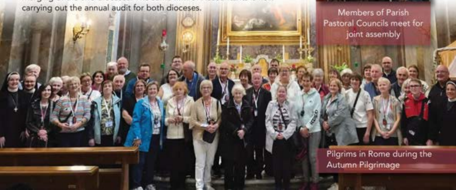
Pilgrims in Rome during the Autumn Pilgrimage