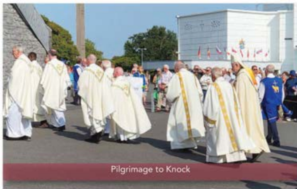
Pilgrimage to Knock