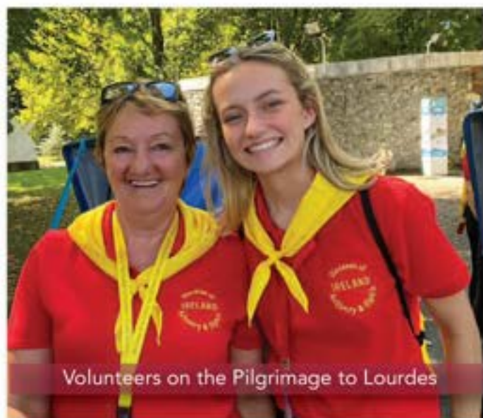
Volunteers on the Pilgrimage to Lourdes