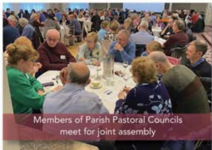
Members of Parish Pastoral Councils meet for joint assembly

I am conscious that most parishioners in Achonry and in Elphin will not have noticed much change on the ground. In many ways, that is good news, because much of the change is at diocesan level and our parishes continue to function effectively and to provide the pastoral care that people need on a daily basis. The kind of change that we need to see when merging two dioceses is primarily organic growth. It is like the change that you see in your children, or indeed in your garden, or on the farm. It happens slowly over time, but it is real growth. If there is structural change, it has to be focussed on supporting spiritual growth and the maturing of our parish communities.