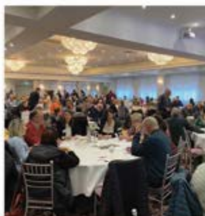
Members of Parish Pastoral Councils meet for joint assembly