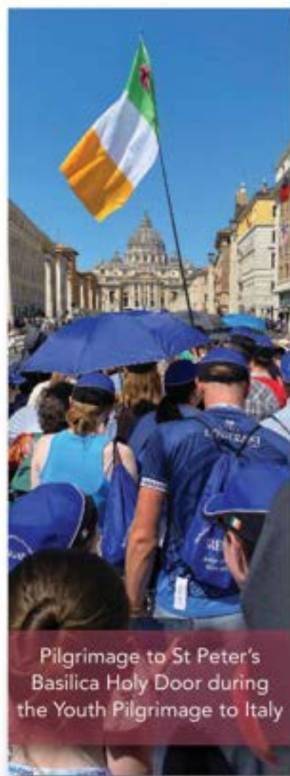
Pilgrimage to St Peter's Basilica Holy Door during the Youth Pilgrimage to Italy